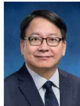
香港特別行政區政府政務司司長 陳國基先生

Mr. Chan Kwok-ki, the Chief Secretary for Administration, the Government of the Hong Kong Special Administrative Region